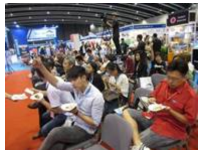
Seafood Cooking Demo – American Indian Foods