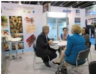
U.S. Pavilion at the Show