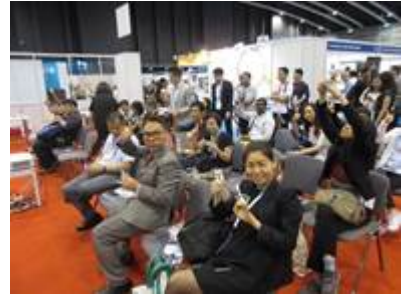
Seafood Cooking Demo – Food Export Northeast