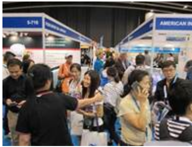
U.S. Pavilion at the Show