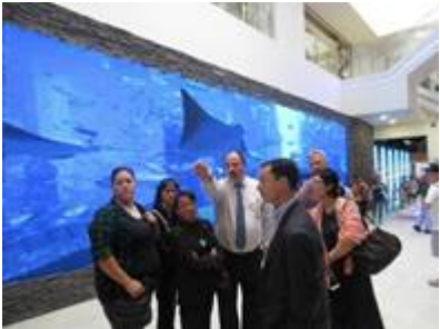
Tour of Local Wet Market