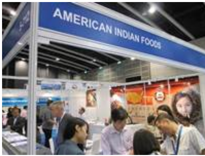
U.S. Pavilion at the Show