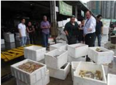
Tour of Fish Wholesale Market