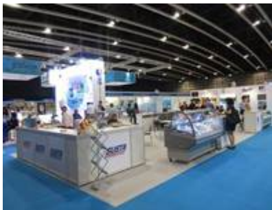
U.S. Pavilion at the Show