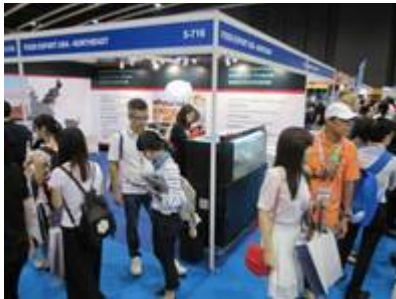
U.S. Pavilion at the Show