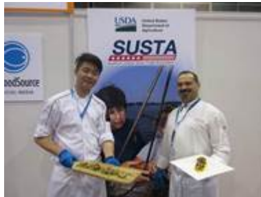
Seafood Cooking Demo – SUSTA