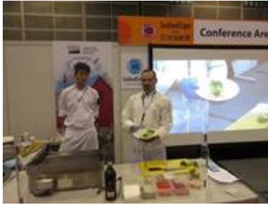
Seafood Cooking Demo – Food Export Northeast