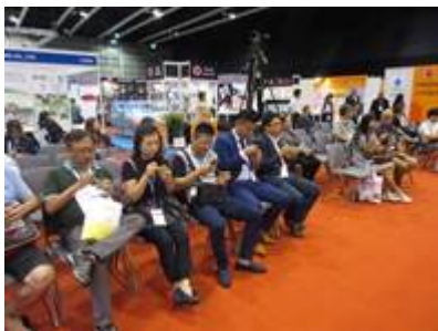
Seafood Cooking Demo – American Indian Foods