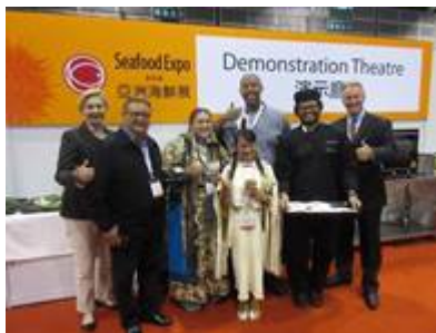
Seafood Cooking Demo – American Indian Foods