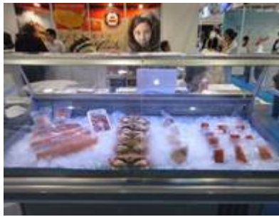
U.S. Pavilion at the Show