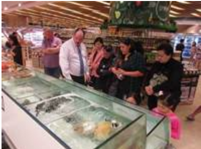
Tour of Food Retail Market