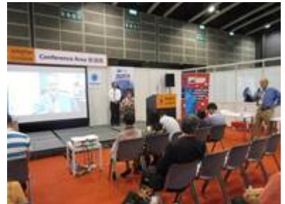
Seafood Cooking Demo – SUSTA