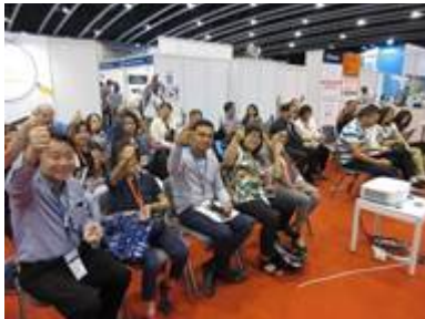
Seafood Cooking Demo – SUSTA