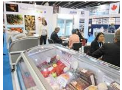
U.S. Pavilion at the Show