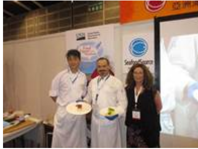
Seafood Cooking Demo – Food Export Northeast